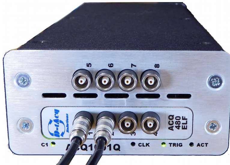
ACQ480ELF-8-LFP mounted in ACQ1001Q appliance