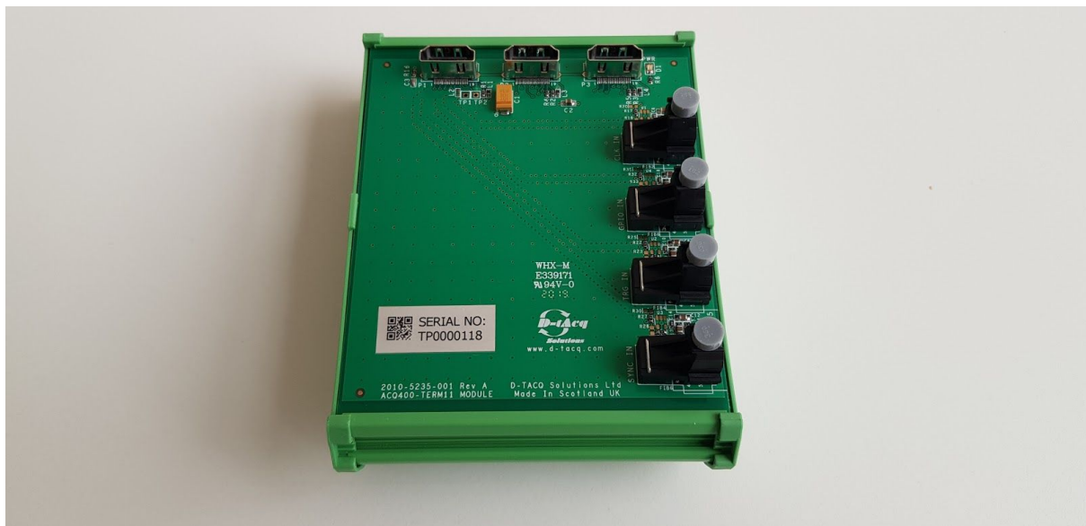
Fig1. Image of the ACQ400-TERM11 Module fitted with “Versalink” fibre optic connectors installed in an 88mm wide DIN rail carrier.

Up to 200 metres @ 10 MBd and 120 metres @ 50 MBd with 200um PCS.