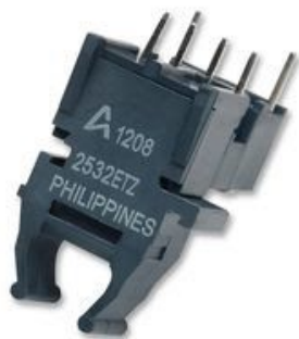
Fig.2 AFBR_2643Z “Versalink” connector.