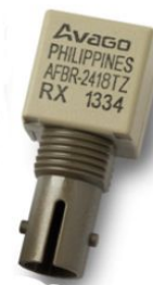
Fig.3 AFBR_2418Z ST connector.